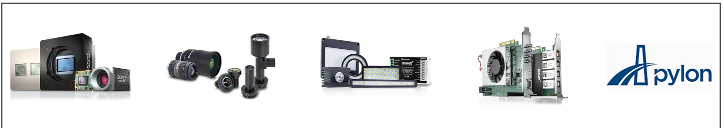
Figure 3. Basler cameras, lenses, lighting, accessories, acquisition cards, and analytics software