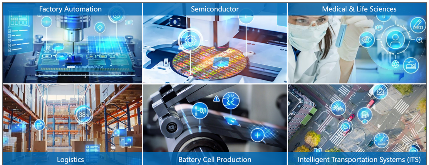
Figure 1. Use cases for Basler manufacturing and industrial solutions

Vision systems are becoming increasingly complex, and many customers have unique requirements. Basler's vision system consultants, engineers, and customization specialists can help manufacturers, OEMs, and systems integrators by supporting their needs with robust custom vision systems that leverage Basler's experience with the newest technologies in both vision and networking to create dynamic and stable vision solutions that make life easier, processes smoother, and applications more efficient. Basler's solutions are deployed in a wide range of manufacturing and industrial use cases (see the figure below). Partnering with Cisco as a Cisco reseller (U.S. only) enables Basler to offer a complete multicamera and AI-enabled vision solution.